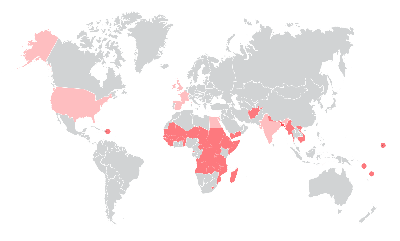
Map Price of Treatment with Sofosbuvir and Type of Agreement Negotiated by Country